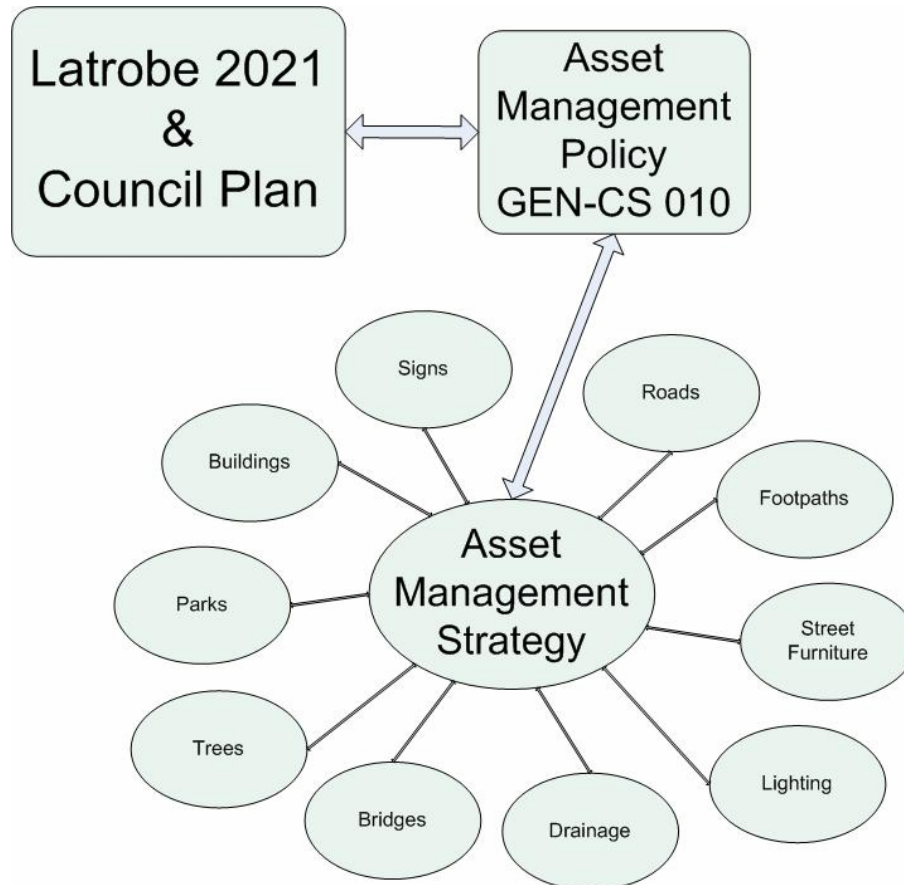
Figure 2 - Relationship between the Road Management Plan and other Council Documents

The Road Management Act offers Council the opportunity to produce a Road Management Plan to gain protection in certain circumstances. Figure 2 shows the link between Council's Road Management Plan to the Asset Management Strategy, Asset Management Policy, Council Plan and Latrobe 2021.